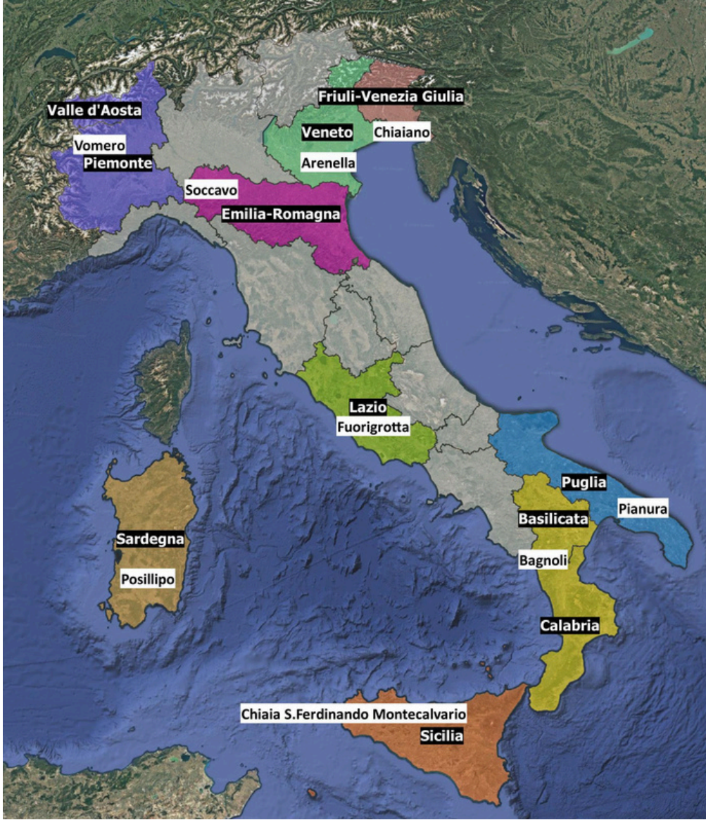
Map of twinning Boroughs/Regions

The red zone includes the municipalities of Pozzuoli, Bacoli, Monte di Procida, Quarto and part of the municipalities of Giugliano in Campania and Marano di Napoli.